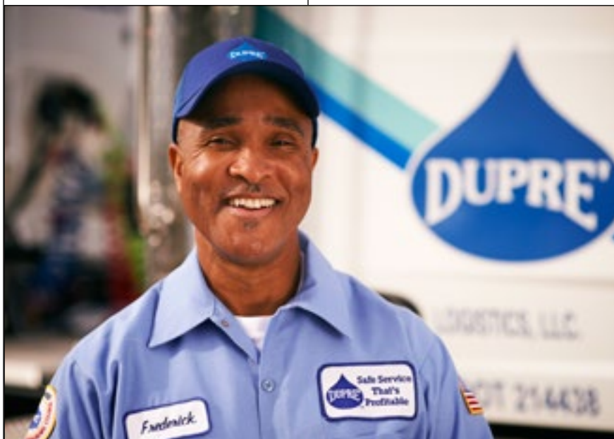
Transporting and handling chemicals requires specialized driver training and license endorsements.