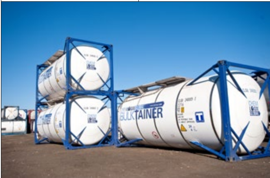
A division of CLX Logistics, ChemLogix’s intermodal service specializes in using bulk ISO intermodal tank containers to ship bulk liquid chemicals long distances.

A&R also must be cautious in its use of vacuum systems to load and unload dry bulk trailers. “We make