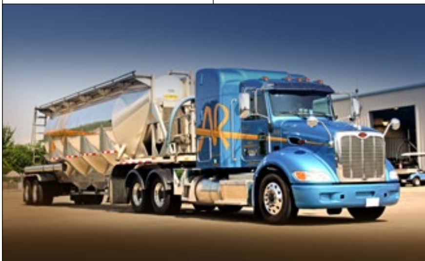
A&R Logistics, a leading dry bulk carrier serving the plastics industry with a fleet of more than 800 trucks and 1,200 trailers, is 100-percent e-Log compliant. A&R supports its fleet with a nationwide network of 23 terminals and 10 warehousing and packaging facilities.

Along with special procedures, chemical warehouses also require special environmental controls. For instance, the chemical DC operated by Weber Logistics in Santa Fe Springs, Calif., has separate rooms