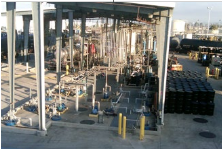
Distributor Brenntag North America buys chemicals in bulk from manufacturers, then repackages them in smaller containers, and delivers to local customers via a private fleet.

June 1, 2015, was the deadline for complying with most provisions of HCS 2012. One big change the rules created is a new set of standards for